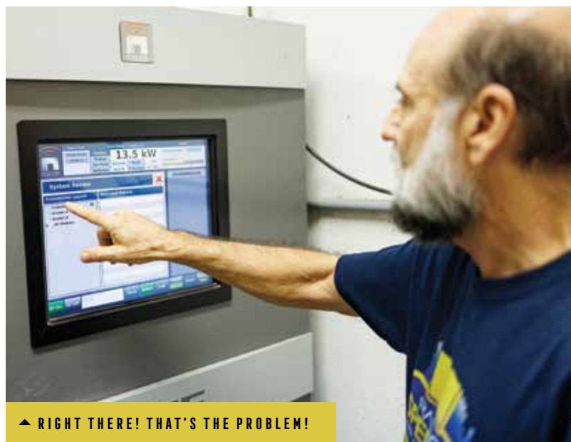
▲ RIGHT THERE! THAT'S THE PROBLEM!

Our radio signal covers a large potential harvest of souls, and I'm going to need someone to train and replace me in the next few years. Such a person must first be motivated to serve Christ's Kingdom, believing that God has called them into this kind of work, and be willing to raise their own financial support. Technical skills and experience are important, but one doesn't need to be an expert in all areas of radio engineering before learning on the job. Could God be calling you or someone you know to join us?